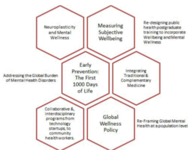
Figure 4. Schema of interdisciplinarity in addressing the global burden of mental health disorder.

This article has brought to the discourse on well-being and mental wellness an evolving paradigm, informed by evidence, measured with validated tools, and already in implementation in different parts of the world, including in both civil society and the corporate sector. An understanding of the importance of the first 1,000 days of life, the neuroplasticity of our brain, and the potential for mental wellness to play an integral role in how people grow, play, work, and live are changing the way people frame health promotion in the 21st century. The vast array of wellness modalities such as yoga, meditation, sleep, nutrition (Firth et al., 2019), technology, and the availability of real-time data are yet to be incorporated into our vision of the future of public health education and program design.