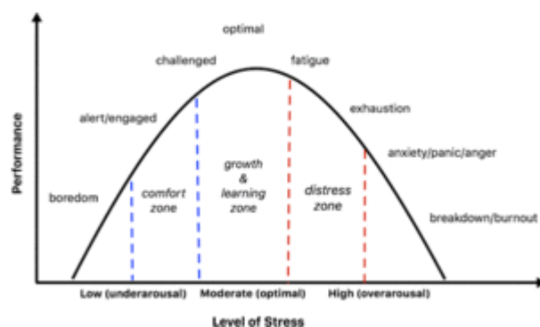
Figure 2. Yerkes-Dodson Law: Inverted U-relationship between stress/arousal level and performance (see Teigen, 1994).

When the prefrontal cortex is exposed to experiential stimuli (i.e., sensory, emotional, and intellectual) at moderate levels of stress, the brain is capable of optimal performance. Too little or too much arousal impairs functioning. The ability to challenge oneself outside the comfort zone promotes neuroplasticity in favour of growth and resilience. Therefore, the deliberate and active maintenance of this perpetual back-and-forth state of balance between optimal stress and restorative rest is vital for driving positive neuroplastic changes.